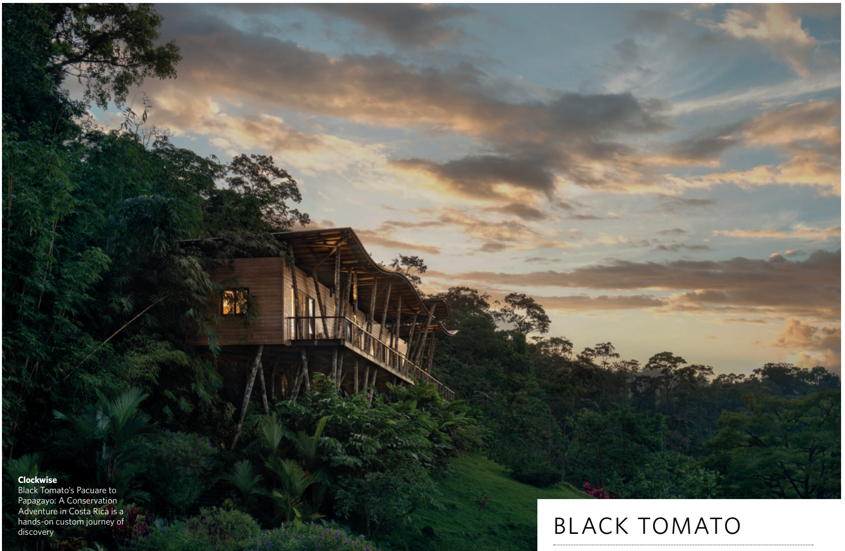
Clockwise Black Tomato's Pacuare to Papagayo: A Conservation Adventure in Costa Rica is a hands-on custom journey of discovery